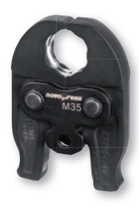
Press jaw PB1