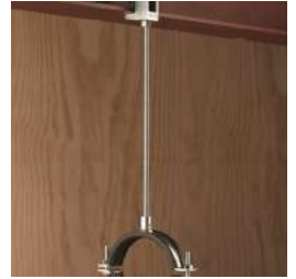
Universal beam clamp for standard beams